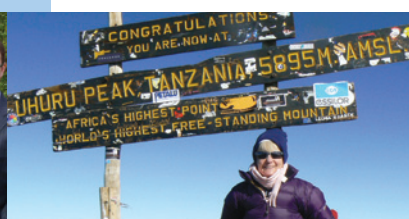
Penny's Challenge page 4