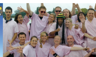
Dragon Boat Race page 4