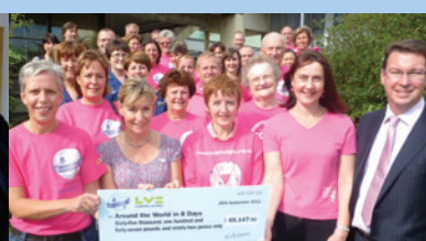
Life Cycle page 4