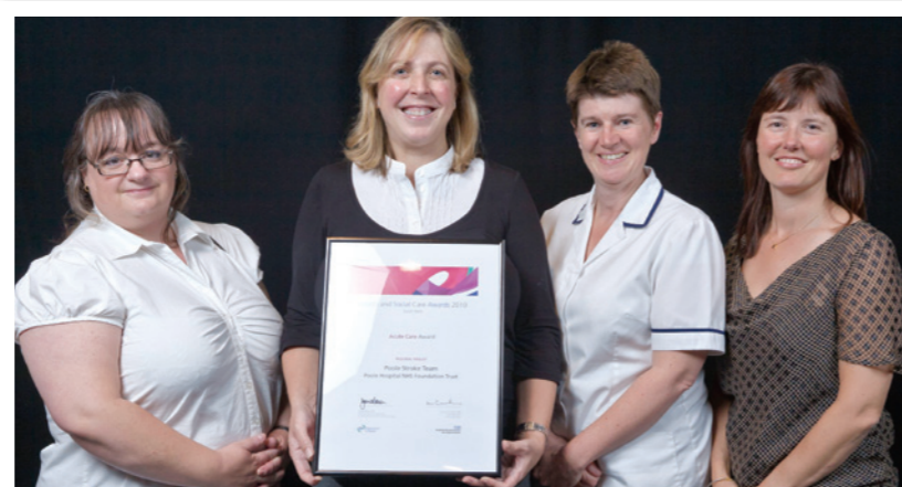
Members of the Poole stroke team accept their Health & Social Care Award certificate which was awarded in recognition of their work to improve care

All of the above took up their new three year term of office on 1 November 2010.