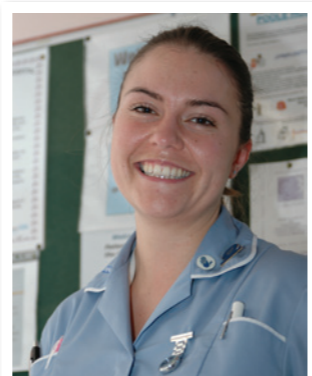
In gaining university status we hope to attract and retain high quality staff