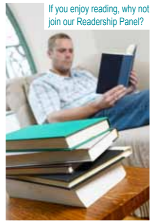
If you enjoy reading, why not join our Readership Panel?

If you would like to know more, please contact the Health Information Team by telephoning 01202 448003 , emailing healthinfo@poole.nhs.uk or writing to Health Information Centre, Longfleet Road, Poole Hospital, BH15 2JB .