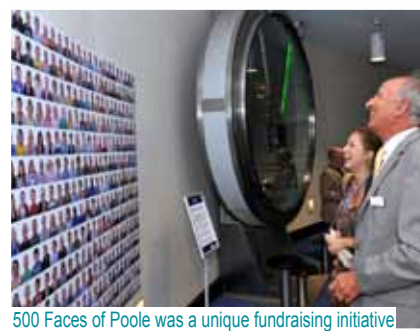
500 Faces of Poole was a unique fundraising initiative

If you would like to raise money for a ward or department within Poole Hospital, please get in touch with our fundraising team by calling 01202 448449 or emailing fundraising@poole.nhs.uk .