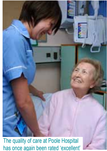
The quality of care at Poole Hospital has once again been rated 'excellent'

This puts Poole Hospital among the top 10% of Trusts in the UK, and makes us one of just 37 acute hospitals to receive a double 'excellent' rating. The Care Quality Commission (CQC)