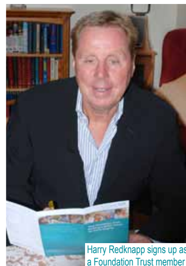
Harry Redknapp signs up as a Foundation Trust member

Harry said at the opening: "Cancer affects every family at some stage and it's so important to do what we can to support these things," adding that the nurses on the ward are "angels".