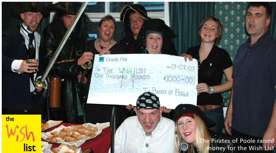
The Pirates of Poole raised money for the Wish List

The Poole Hospital Wish List was launched in 2004. It is an ongoing scheme which raises money for all wards and departments throughout the Hospital.